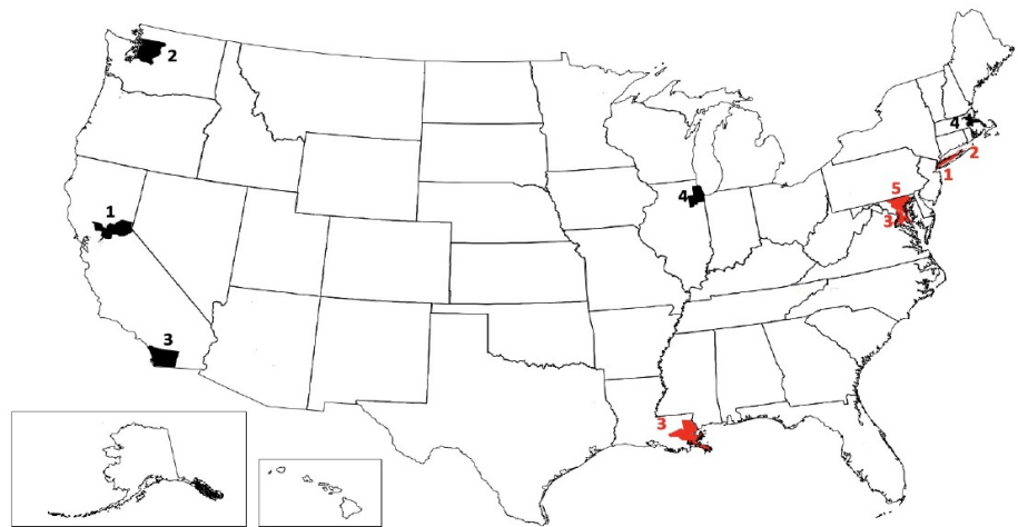
Metro Areas with Largest Construction Employment Changes, September 2020–September 2021