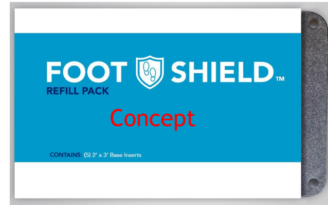
Cintas Item # X9921