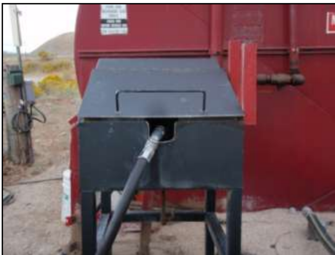
6,000 Gallon Diesel AST – Custom Fabricated Dispenser Nozzle Holder

Periodically, accumulated stains (less than 5-gallon volume) are scooped up. Generally, all media resulting from cleanup of non-reportable quantities of petroleum products are placed in a 55-gallon drum and appropriately secured. Once the drum is filled, a composite sample is collected to characterize the waste and evaluate disposal options, which may include treatment prior to disposal or direct deposit in our dumpster, upon approval from the local landfill. Also keep in mind that any accumulated stormwater in this lined area must be periodically pumped. We check for presence of an oil sheen prior to pumping. If no sheen is present, it is safe to upland infiltrate adjacent to the AST. If there is a sheen, we call an oiler to suck up the contaminated water for disposal/recycling. Generally, if you secure an oil absorbent boom (some come with carabiners) in the corner of your sump, then most if not all of the oil product is absorbed. It is obvious when it is time to replace the boom because the dominant color shifts from white (new out of the package) to dark brown. You can dispose of the used boom in a dumpster as long as no free product is present. Remember to document containment area drainage events with the SPCC plan.