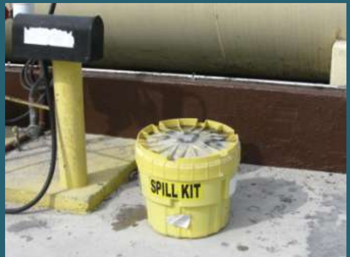
Example Spill Kit