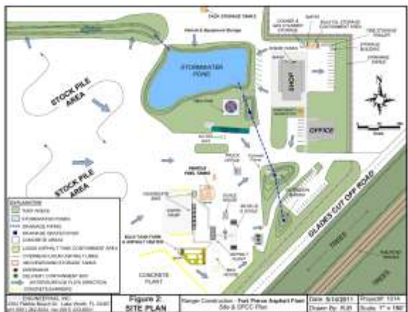
Example Required USGS Quadrangle Map with Subject Site Indicated (top) and Example Facility Site Map (bottom)