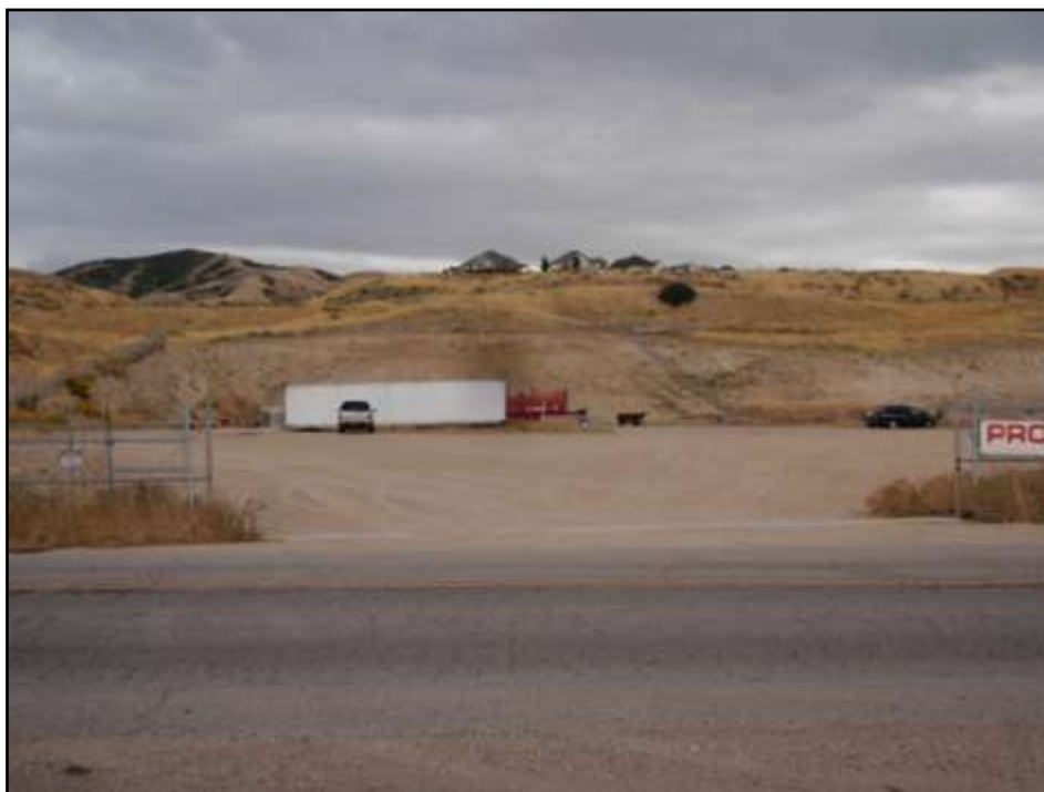
6,000 Gallon Diesel AST – Security Perimeter Fence – Gate Is Closed and Locked at the End of Every Shift

I encourage you to spend the time upfront and develop a template plan for your company (Tier II facilities) and familiarize yourself with EPA's template (Tier I facilities). You will still have to fill out forms for each site that must comply with the SPCC requirements, but these templates will save you time and expense in the long run.