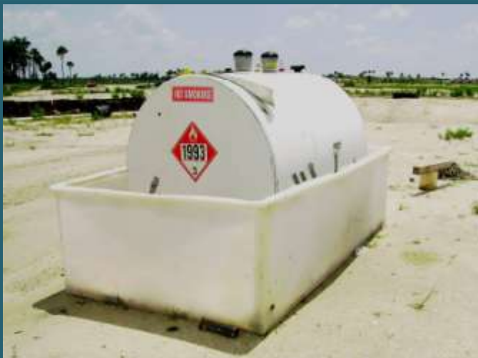
Example Secondary Containment

The written plan must be kept at the facility (or site) if it is "manned" four (4) or more hours per day. If staffed less than four hours per day, then keep the plan at the closest field office.