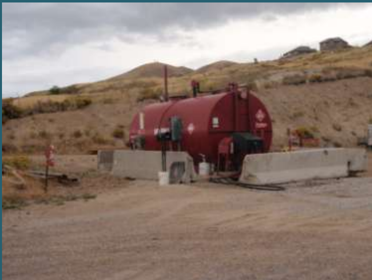
6,000 Gallon Diesel AST – Precast Portable Concrete Barrier Rail for Attenuating Potential Crash Impact (left) and Example Facility Site Diagram (right)

Before I start to write the SPCC plan narrative, I visit the site to get the facility diagram and layout maps correct and to make sure that the tank was set up in the best possible spot to minimize or even avoid the potential for a discharge ( i.e. , spill) into a “waters of the United States” during filling/dispensing activities. I also take several photos for desk reference. The plan itself must have a general location map and a more detailed diagram or layout of the jobsite.