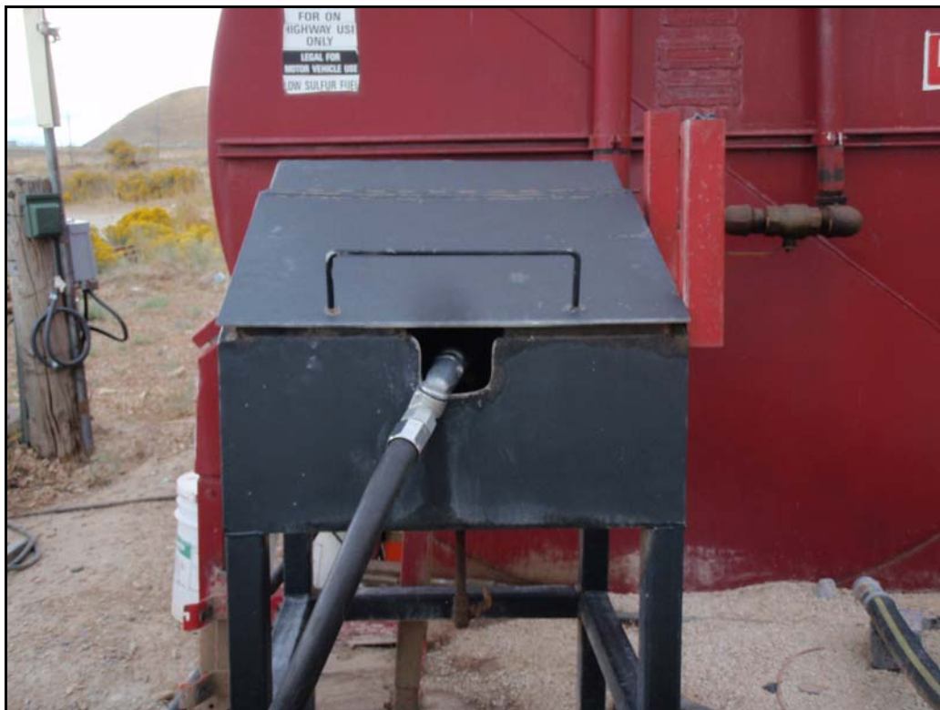
PHOTO #4 - 6,000 Gallon Diesel AST - Custom Fabricated Dispenser Nozzle Holder