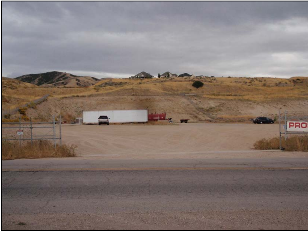
PHOTO #5 - 6,000 Gallon Diesel AST – Security Perimeter Fence – Gate is Closed and Locked at the End of Every Shift