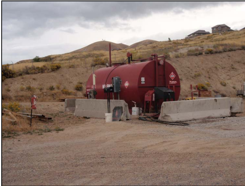
PHOTO #1 - 6,000 Gallon Diesel AST - Precast Portable Concrete Barrier Rail for Attenuating Potential Crash Impact