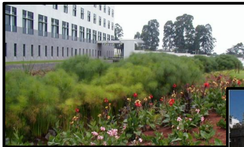
Nairobi Water Garden