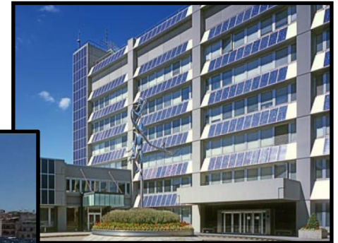
Geneva Photovoltaic Curtain Wall