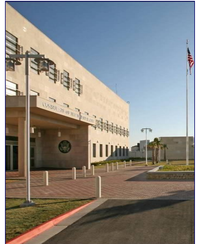
Ciudad Juarez, Mexico