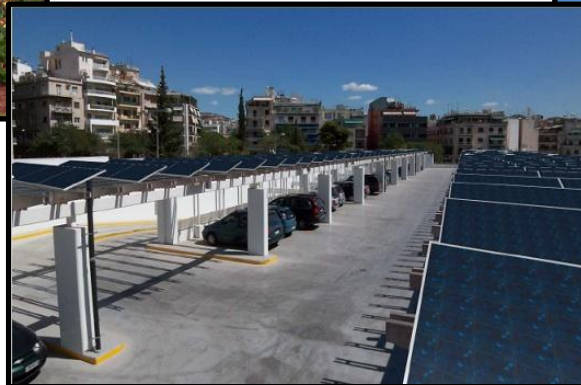
Athens Pergola Photovoltaic Panels