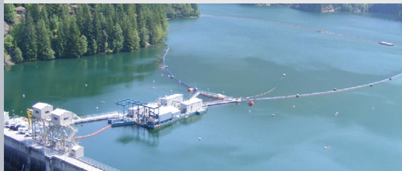
Build America Award: Municipal & Utility New | Upper Baker Dam Floating Surface Collector | Concrete, Washington | The Natt McDougall Company