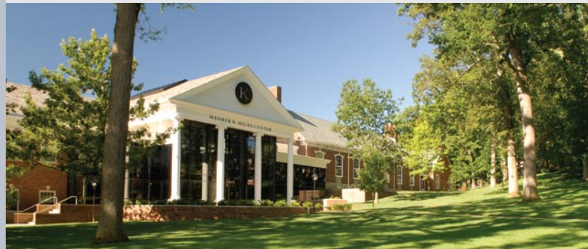
Build America Award: Construction Management Renovation | Kalamazoo College Hicks Center | Kalamazoo, Michigan | Miller-Davis Company