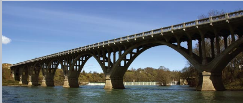
Build America Award: Highway Renovation | Oregon Highway 99 – North Umpqua River (Old Winchester) Bridge Rehabilitation | Douglas County, Oregon | Hamilton Construction Company