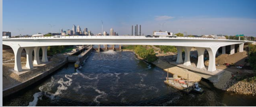
Build America Award: Highway New | I-35W Bridge (St. Anthony Falls) | Minneapolis, Minnesota | Flatiron-Manson, a Joint Venture

THE PROJECT YOU ARE WORKING ON RIGHT NOW MAY BE A WINNER! ALL ENTRIES MUST BE RECEIVED NO LATER THAN FRIDAY, NOVEMBER 6, 2009.