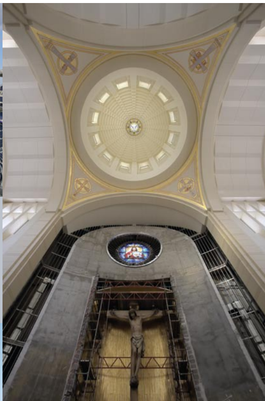
Above: Build America Award: Building New | Co-Cathedral of the Sacred Heart | Houston, Texas | Linbeck Group Below: Build America Award: Federal & Heavy New | Monumental Dam Removable Spillway Weir | Kahlotus, Washington | Advanced American Construction, Inc.